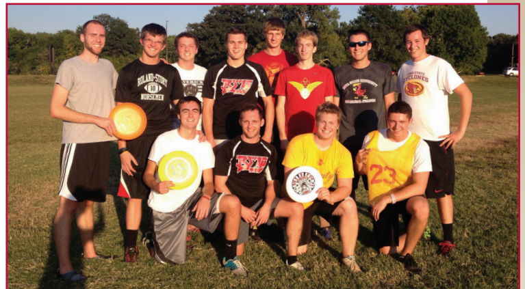
Beta Sig were ultimate Frisbee champions in the fall.

Join Epsilon Chapter for a Homecoming tailgate on October 11, 2014, when Iowa State takes on the Toledo Rockets. A block of tickets will be available to actives, alumni, family, and friends. Look for more details on our Facebook page and website. We hope to see you there!