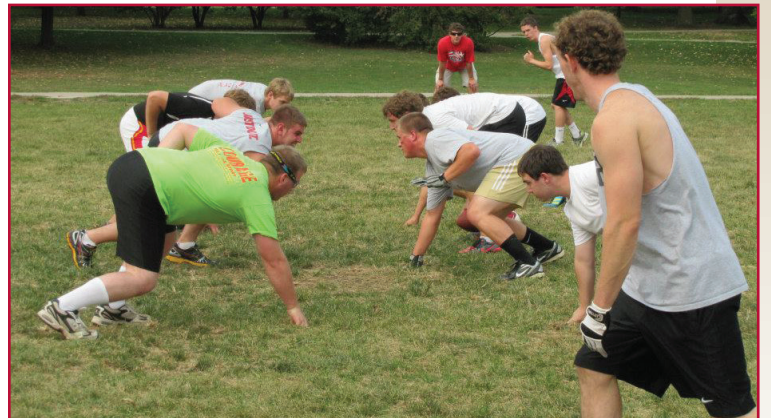
The traditional Beta Sig football game played every fall.