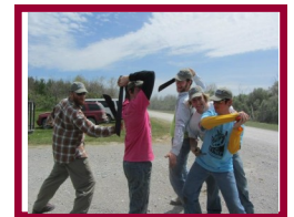
Beta Sigs having some fun while on the mission trip.