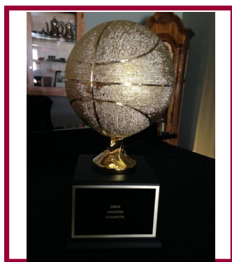
The Greek Madness Trophy being proudly displayed at Beta Sigma Psi.

New for 2015, the Greek Madness Championship will be serving its inaugural year. The Greek Madness Tournament consists of four different houses all playing for the title. Houses consist of Beta Sigma Psi, Phi Kappa Theta, Alpha Tau Omega, and Delta Upsilon. The tournament was held March 8th and had a very high level of participation from all houses. We all played 2 games, (first to 21 by 1s and 2s and you have to win by two) the winners of the first games played each other for the championship, the losers played in a conciliation round.