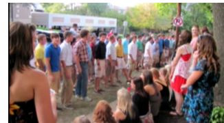
Men getting their serenade on during Sorority Serenades.