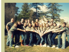
Beta Sigs and part of the Greek Week pairing.

learning by focusing on sisterhood, service, scholarship, leadership, loyalty and character development. The innovative leadership and organizational practices of Alpha Phi's Founders in 1872 set the spirit for the Alpha Phi of today: a sisterhood that values the past but looks forward to the progress offered by the future.