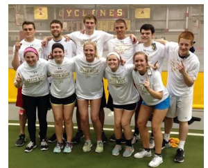
Greek Week: Treds Champions