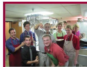
Beta Sigs having fun in the kitchen.