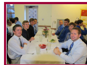
Waiting patiently with manners for dinner.