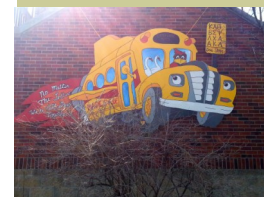
Greek Week banner