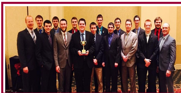
To the left: The men of Beta Sigma Psi and alumni who attended MEF with the Founder's Cup Award.