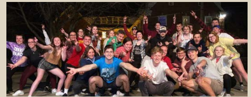
Our Spiderman-themed lip sync group wrap up their last practice as they get ready to perform at Greek Week.