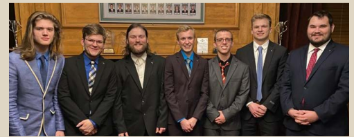
Our newly activated brothers ready to head into the spring semester as full members of Beta Sigma Psi!