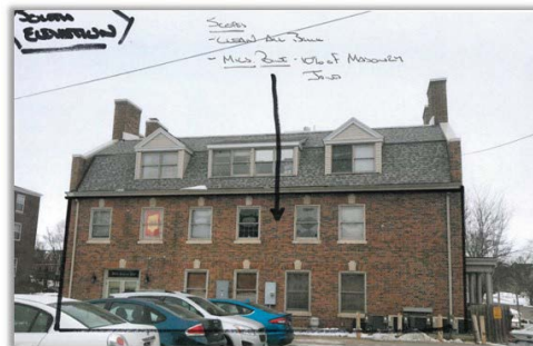
The south elevation will have 100% clean brick and up to 10% tuckpointing.