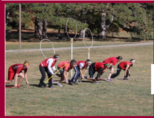
The Quidditch team begins a practice match on Central Campus.