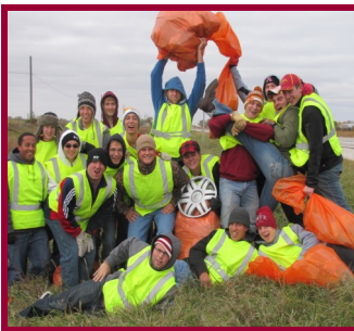
The guys celebrating after doing community service, having completed our annual Highway Clean Up!