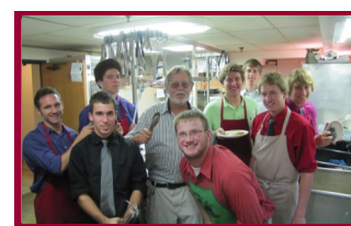
The Kitchen Crew of Beta Sig Brunch, with the star of the show, Cookie!