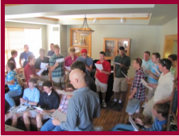
Practicing the Welcome Back Serenade for ISU's Sororities at the beginning of the year