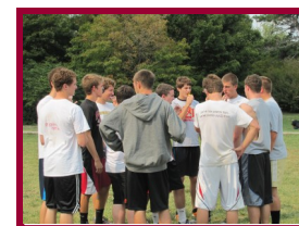
The 2012 Associate Class in the Huddle during the Active vs. Associate Football Game.